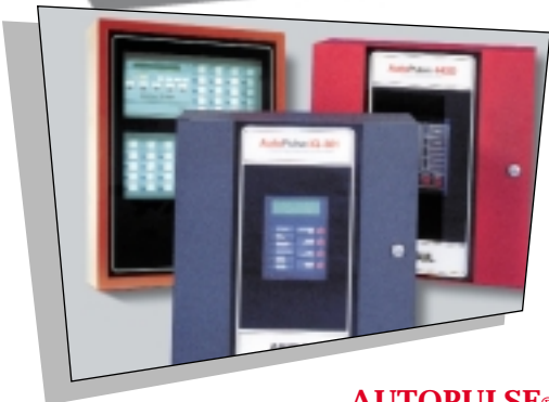
AUTOPULSE® Control Units