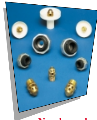
Nozzles and Manifold Orifice Devices