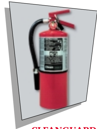
CLEANGUARD® Hand Portable Fire Extinguishers

INERGEN agent is stored as a gas mixture in DOT approved cylinders. INERGEN cylinders can be installed either vertically or horizontally – and are available in various sizes – allowing the system design engineer to store the proper amount of agent in the fewest number of cylinders to save space and installation costs.