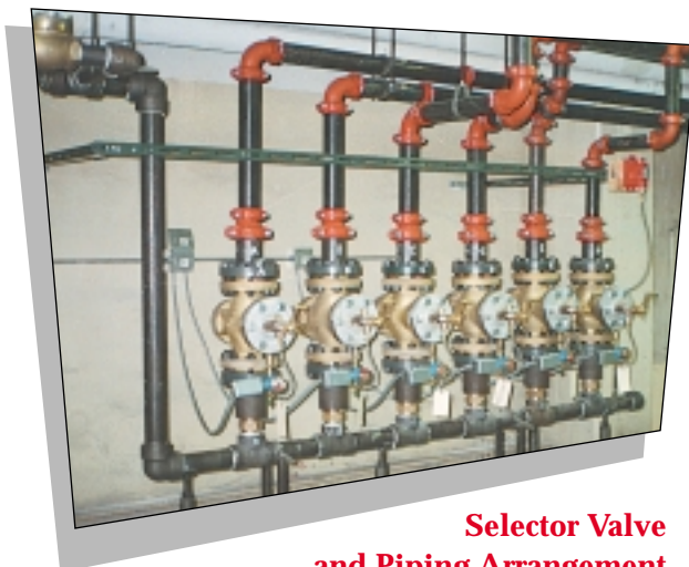
Selector Valve and Piping Arrangement