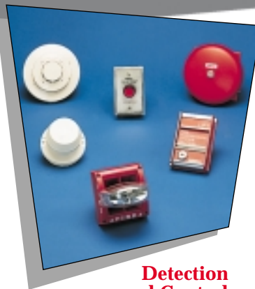
Detection and Control Equipment