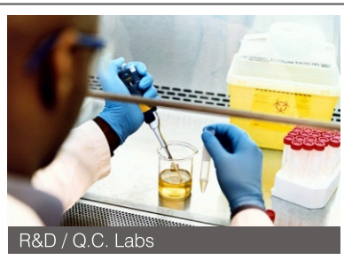
R&D / Q.C. Labs